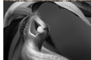
Black & White 1st: Nancy Bonhaus