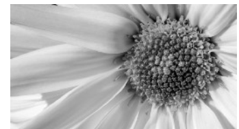
Black & White 1st: Beth Gravett