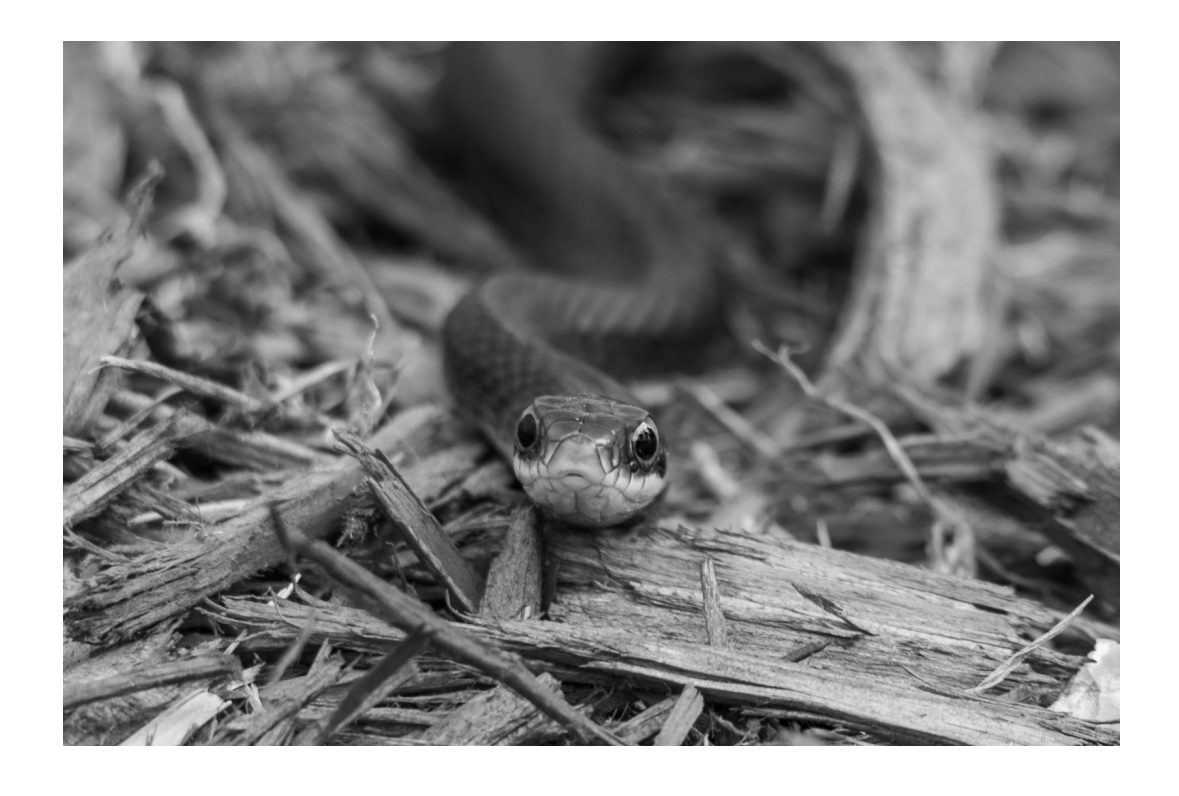
Barbie Carter —Intermediate