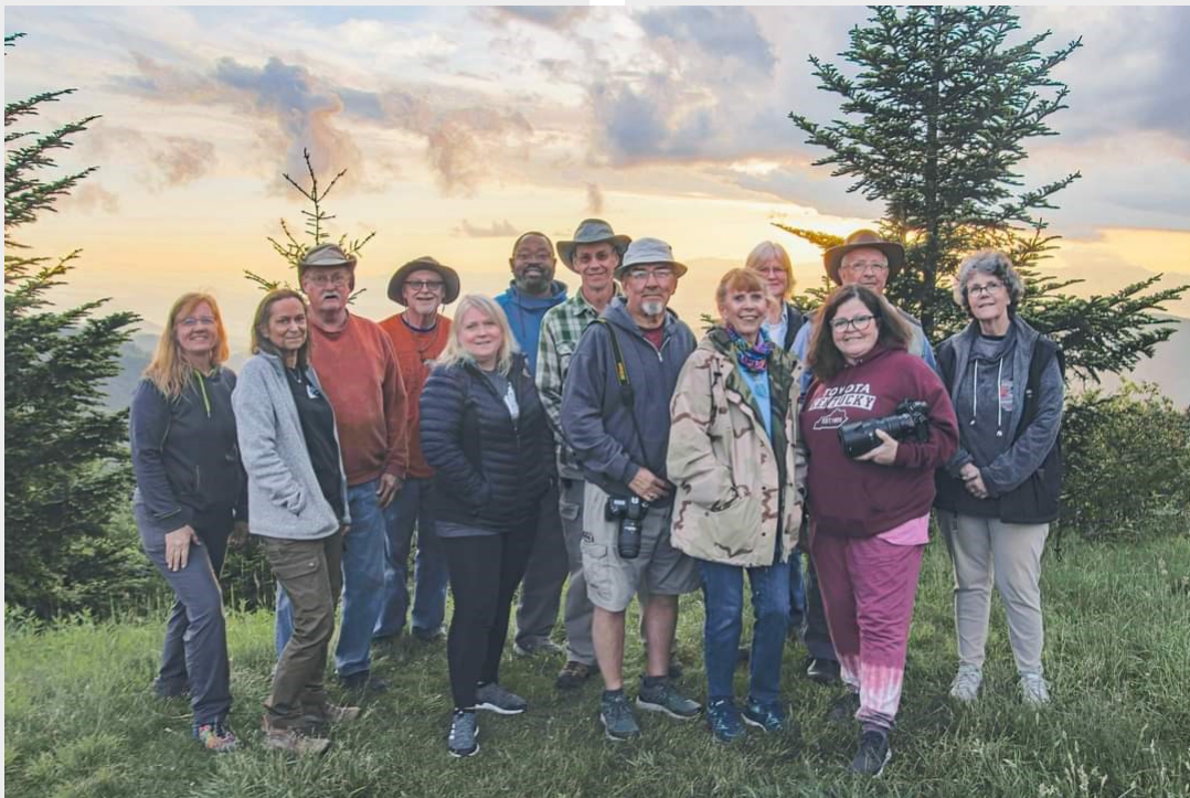
Intrepid Travelers to BRP 2022