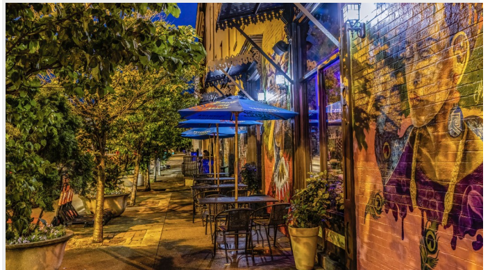
Shuling Fister — Beginner